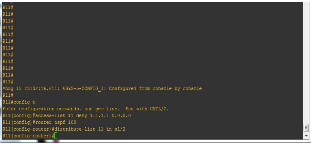
Figure 5 shows the configuration of ACL at the inbound to router R11 at S1/2