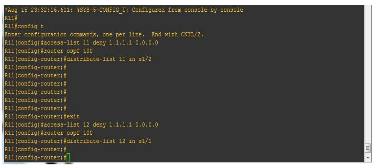
Figure 6 shows the configuration of ACL at the inbound to router R11 at S1/1