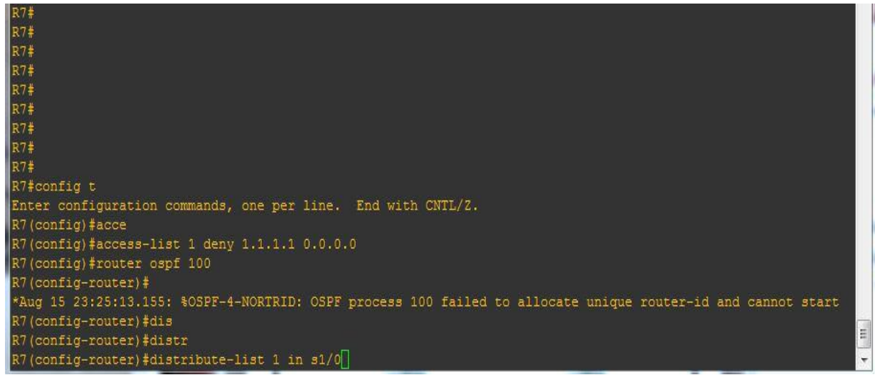
Figure 2 shows the configuration of ACL at the inbound of router R7.